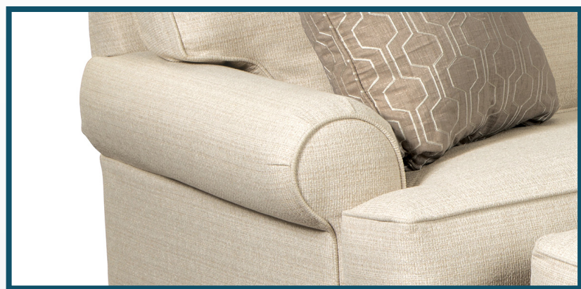
2 Sock Arm