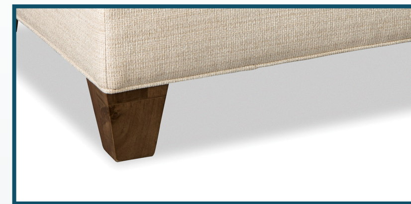
2 Tapered Leg