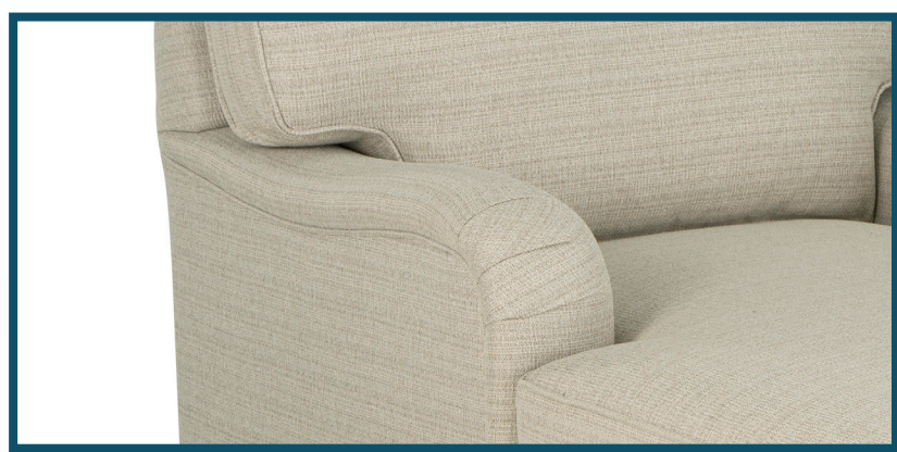
5 English Arm