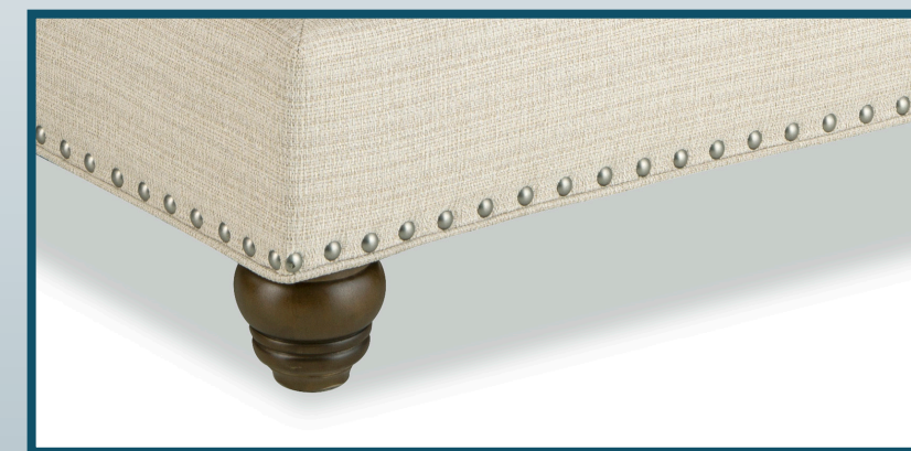
5 Turned Leg W/ Nails