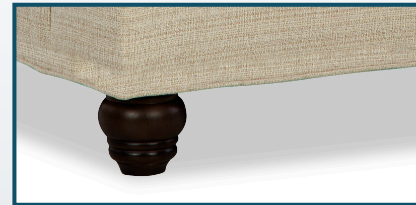
3 Turned Leg