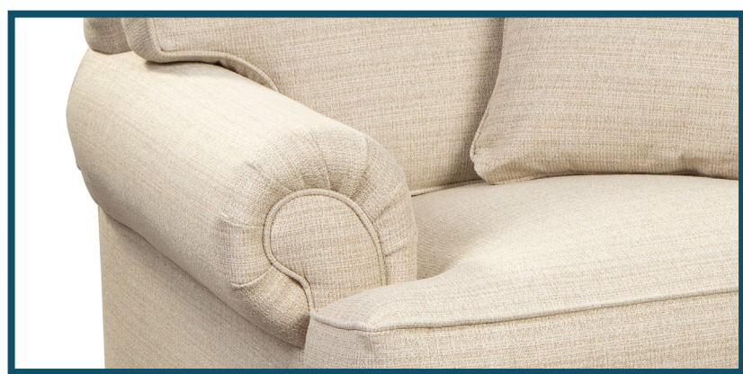
1 Panel Arm