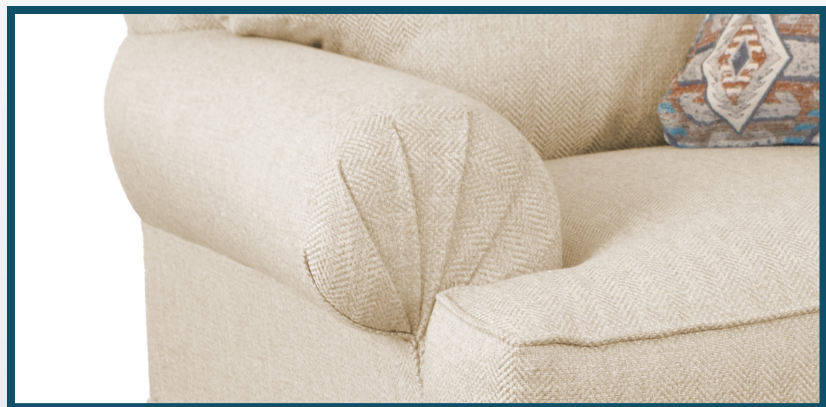
3 Pleated arm