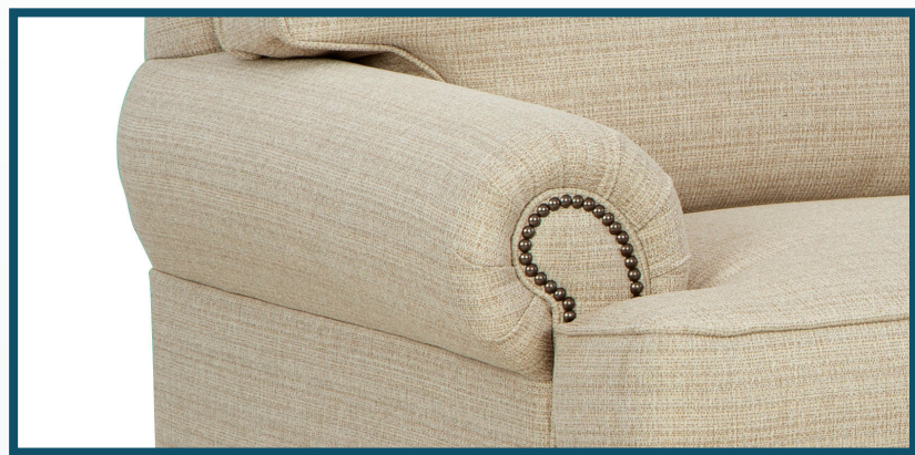
6 Panel Arm W/ Nails