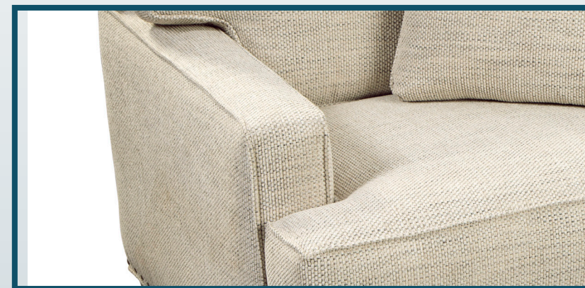
4 Track Arm