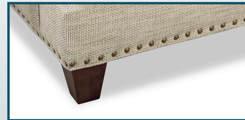
4 Tapered Leg W/ Nails