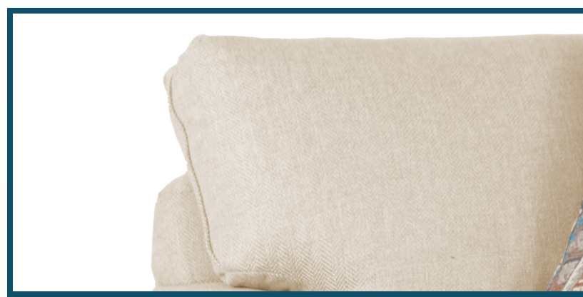
1 Semi-Attached Knife Edge Back