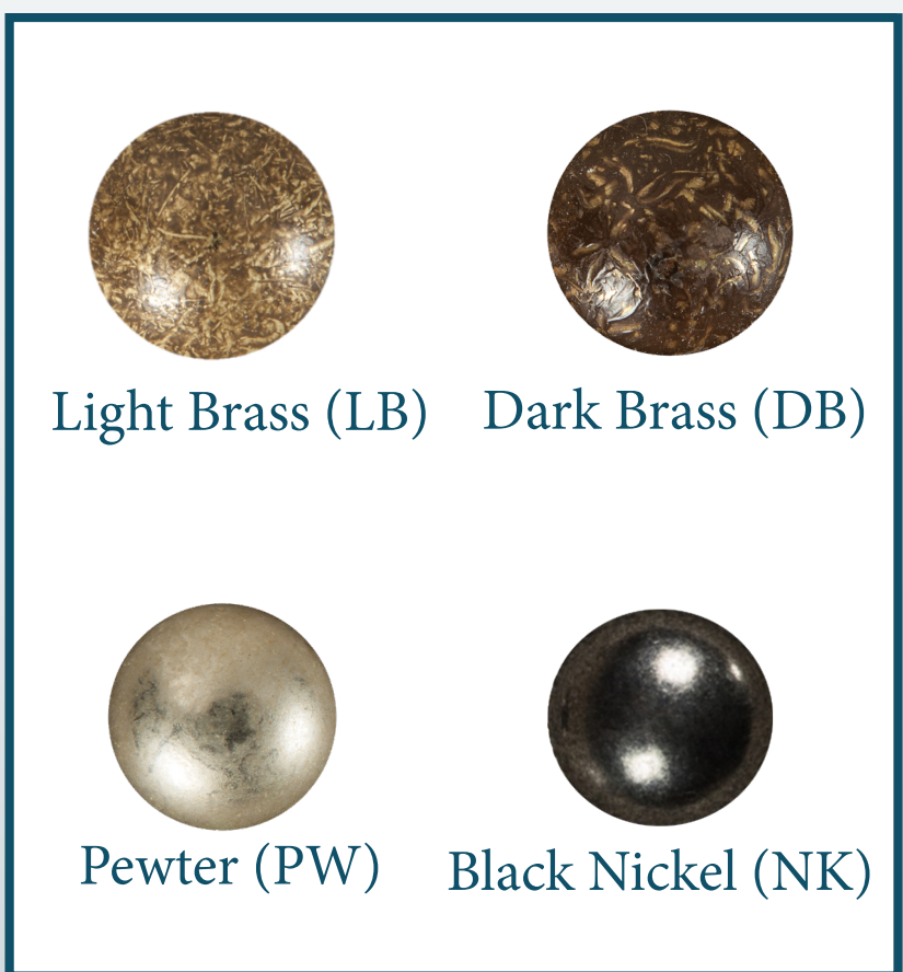
Light Brass (LB) Dark Brass (DB)