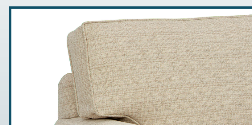
4 Loose Boxed Back